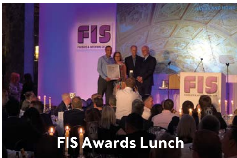
FIS Awards Lunch