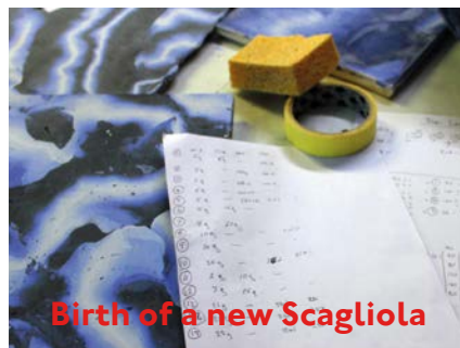
Birth of a new Scagliola