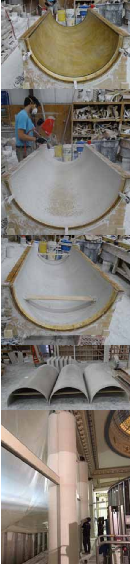
Manufacture and installation of large columns.