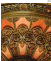
Photographic detail of the central rose is pictured above.