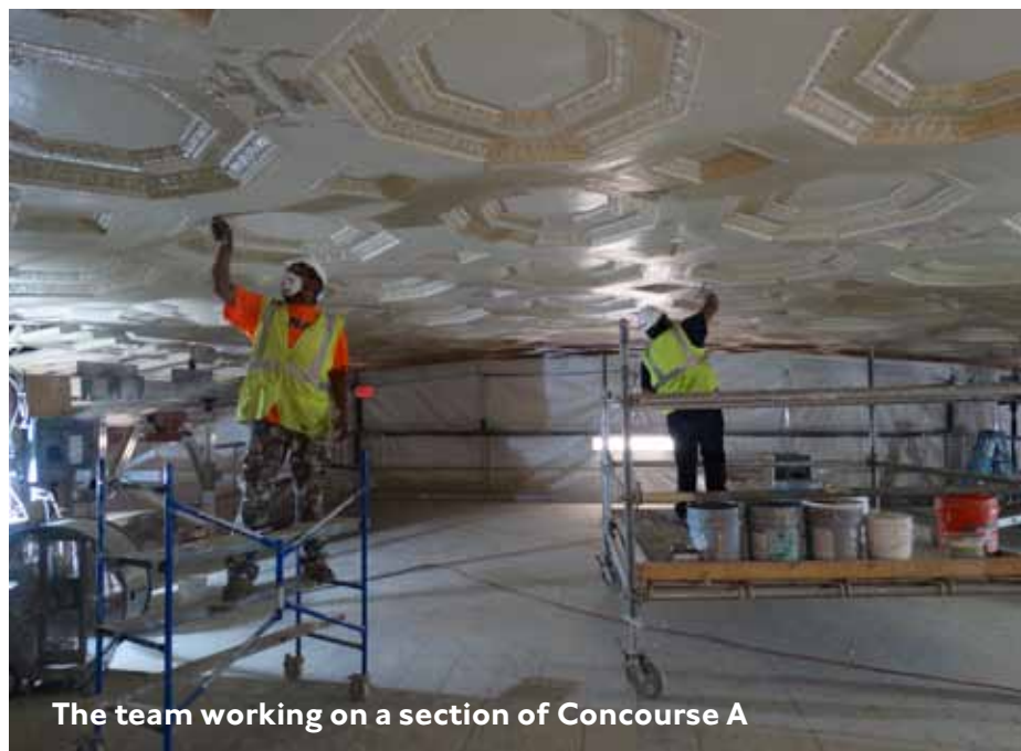
The team working on a section of Concourse A

This year the Hayles and Howe team were proud to successfully complete the full restoration of the Main Hall and move into the Concourse area. The plan is to do about 20 percent of the ceiling at a time. Once each section is completed, the scaffolding is moved along to the next section.