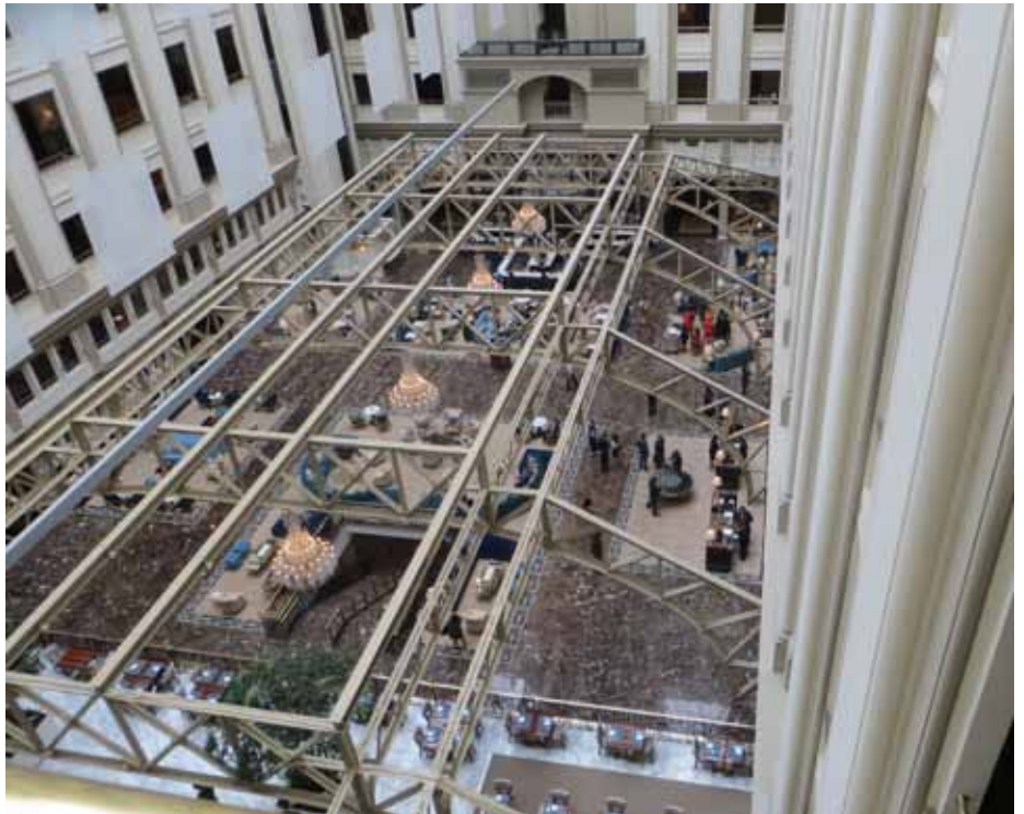
Hayles and Howe, Inc have been involved in the unique restoration of this massive granite, steel framed building in Washington DC (pictured above). This listed building was originally designed in the late 1800's to house the U.S. Post Office Department, it has twice survived near demolition to be saved and preserved as the Trump Hotel.