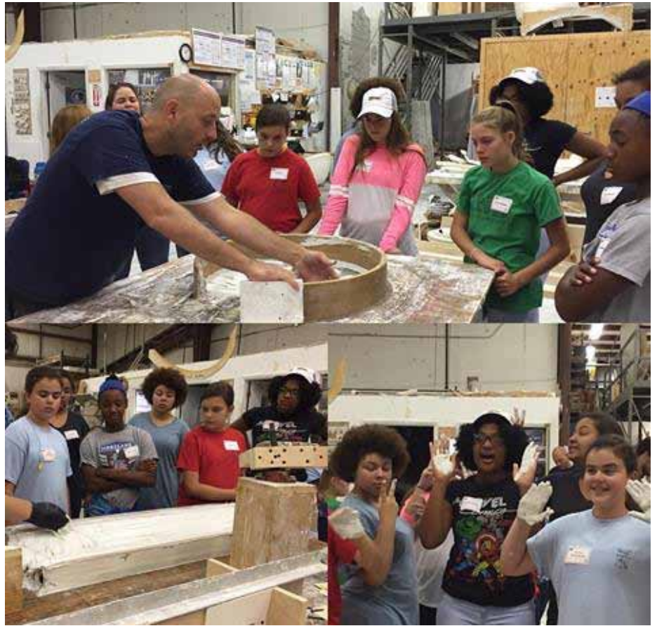
A group of young students (pictured above) from MAGIC in Baltimore recently had a great day out in the USA workshop. MAGIC is a free, week-long day camp for 7th to 12th grade girls to introduce them to a potential career in the construction industry. Many young girls are unaware of the possibility of a rewarding and financially beneficial career in the construction trades or related fields. MAGIC is designed to give them real hands-on experience.